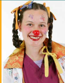
Butterfly Therapeutic Clown