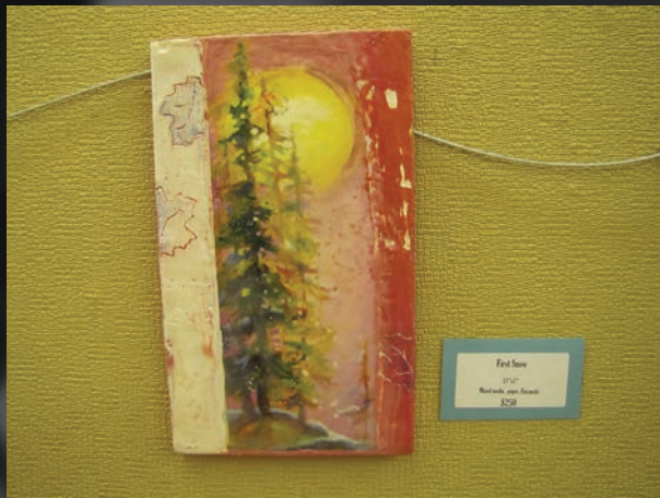
First Snow 17" x 7" Mixed media on paper $200