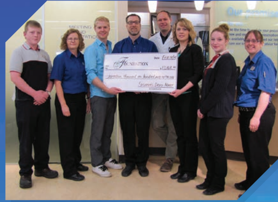
The Shoppers Drug Mart Tree of Life campaign raised over $17,000 to go towards enhancing women's health in our community. This ongoing support has really made a difference in many lives here in Grande Prairie.