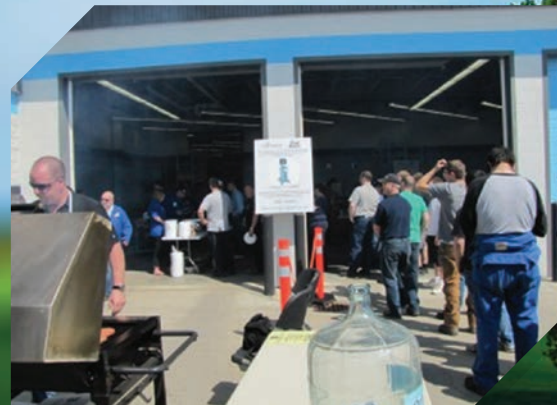
Grande Prairie's Gregg Distributors staff hosted an amazing BBQ that raised $15,000. These funds went towards the purchase of a Portable Ultrasound Machine for the Emergency Room of the QE II Hospital.