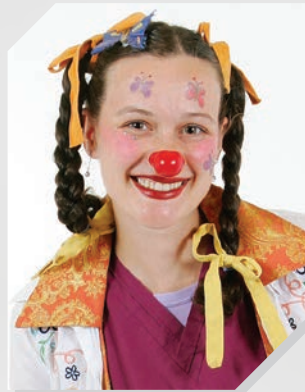
Butterfly Therapeutic Clown