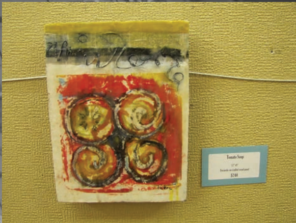
Tomato Soup 17" x 7" Mixed media on paper $200